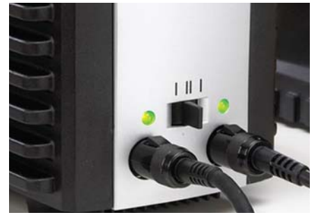
Three position switch. Select left, right or center (both ports operational) to power hand-pieces

To view the complete range of cartridges and tips please visit www.okinternational.com