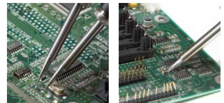
Precision Tweezers rework SMD components with fine dimension to large blade geometries, while the Soldering Tip hand-piece has exceptional power for production soldering.