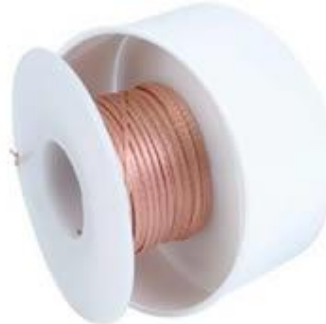
1809-25F Pro Wick Yellow #2 Braid - AS 25' 1 units/case