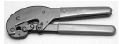
Deluxe Crimp Tool for RG-6, 11, UHF-8 .406, .359, .102 Hex Size (for BNC, N and UHF connectors)