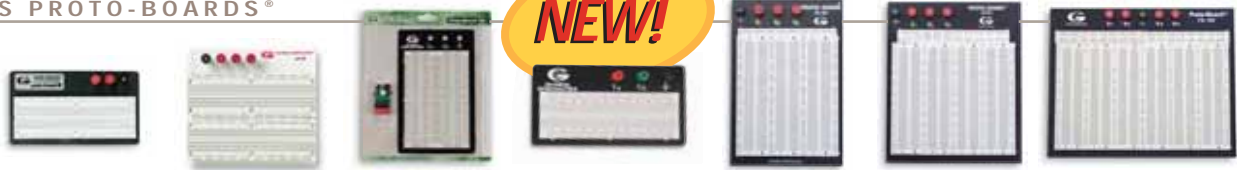
PB-10 PB-60 PB-70 PB-83 PB-103 PB-104 PB-105