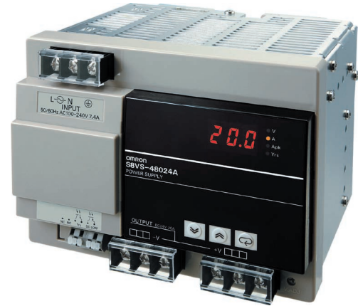
NEW 480 W models provide 20 Amps in a compact package