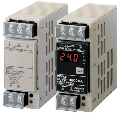
Compact plastic enclosure 60 W models