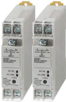
Super slim 15 & 30 W models