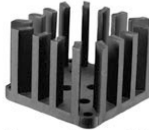
Representative Photo Only