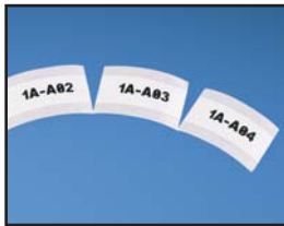
Partial Cut Strip of Labels