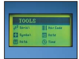
Customize Labels with Advanced Features