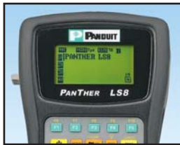
Graphic Display with Backlight