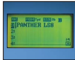
Text Editor Allows Simple Label Creation