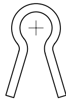
SHOWN AS SUPPLIED

THIS DOCUMENT IS THE PROPERTY OF KEYSTONE ELECTRONICS CORP. AND SHALL NOT BE REPRODUCED, DISTRIBUTED OR USED AS A BASIS FOR MANUFACTURE WITHOUT PRIOR WRITTEN PERMISSION FROM KEYSTONE ELECTRONICS CORP.