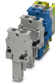
Illustration shows versions of the SP 4/1-... connector in various colors

http://eshop.phoenixcontact.de/phoenix/treeViewClick.do?UID=3042816