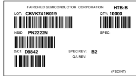
F63TNR Label sample