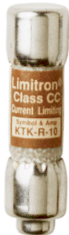
KTK-R-30 Fast Acting, Class CC Fuse