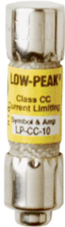
LP-CC-10 Class CC, Time Delay Fuse

Homepage About Cooper Bussmann Contact Us Privacy Legal Cooper Bussmann® Brand Site Map