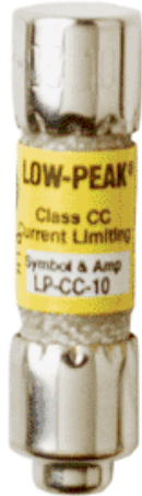
LP-CC-20 Class CC, Time Delay Fuse

Homepage About Cooper Bussmann Contact Us Privacy Legal Cooper Bussmann® Brand Site Map