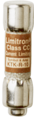
KTK-R-10 Fast Acting, Class CC Fuse

Homepage About Cooper Bussmann Contact Us Privacy Legal Cooper Bussmann® Brand Site Map