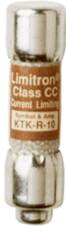
KTK-R-2 Fast Acting, Class CC Fuse