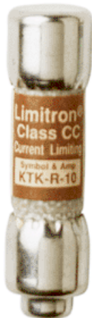
KTK-R-1 Fast Acting, Class CC Fuse

Homepage About Cooper Bussmann Contact Us Privacy Legal Cooper Bussmann® Brand Site Map