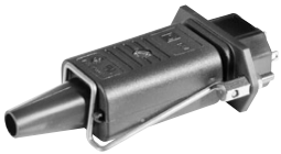
Cord retaining kits Cord retaining strain reliefe