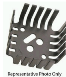
Representative Photo Only

Part Number - 552703B00000G RoHS Compliant