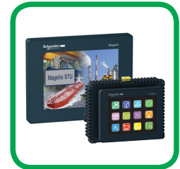
5.7" or 3.5" screens