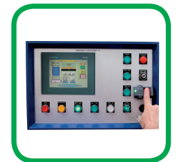
Mounting in enclosure