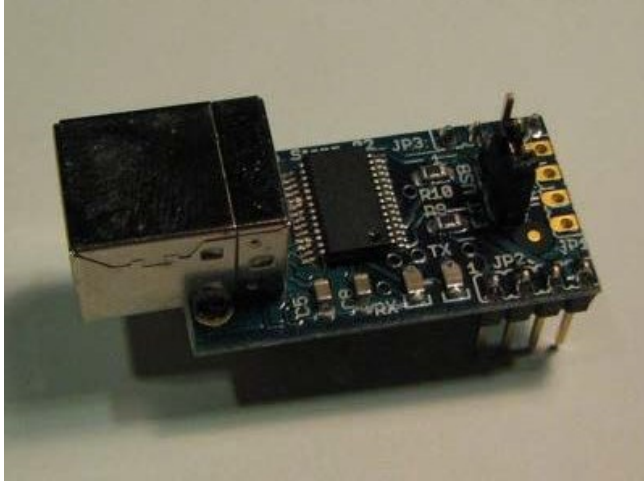
Photo of an original Mini USB Adapter

This board converts a USB connection into 5 volt TX and RX that you can connect straight to the Arduino Mini or other microcontrollers, allowing them to talk to the computer. It is based on the FT232RL chip from FTDI ( drivers are included with the Arduino software).