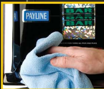
Microfiber Perfect for Chrome Polishing

Microfiber Terry Cloth Cleans & Polishes Wet or Dry.