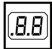
FE1901 Actual Size