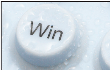
No infection traps