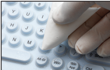
Easy to wipe down