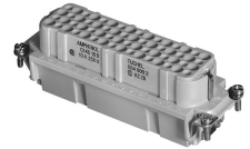
Abbildung stellvertretend für alle verfügbaren Polzahlen.