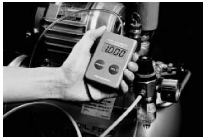
Measurement of source pressure from a compressor.