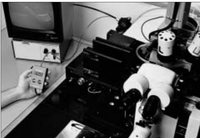
Measurement of air pressure for a automatic machinery.