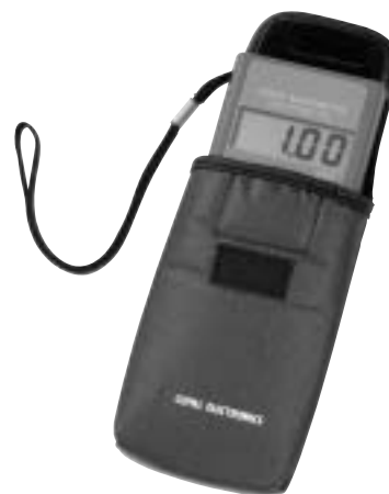
The soft carrying case for PG-100 (Option)