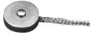
Model 13 Compression Only