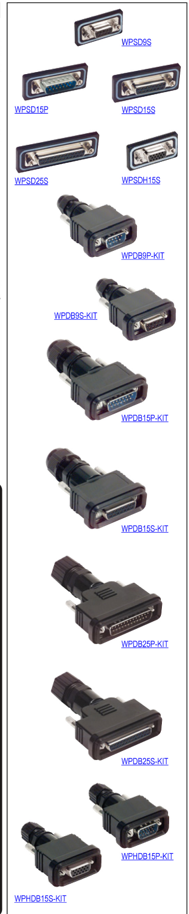
2008 Master Catalog 1.0