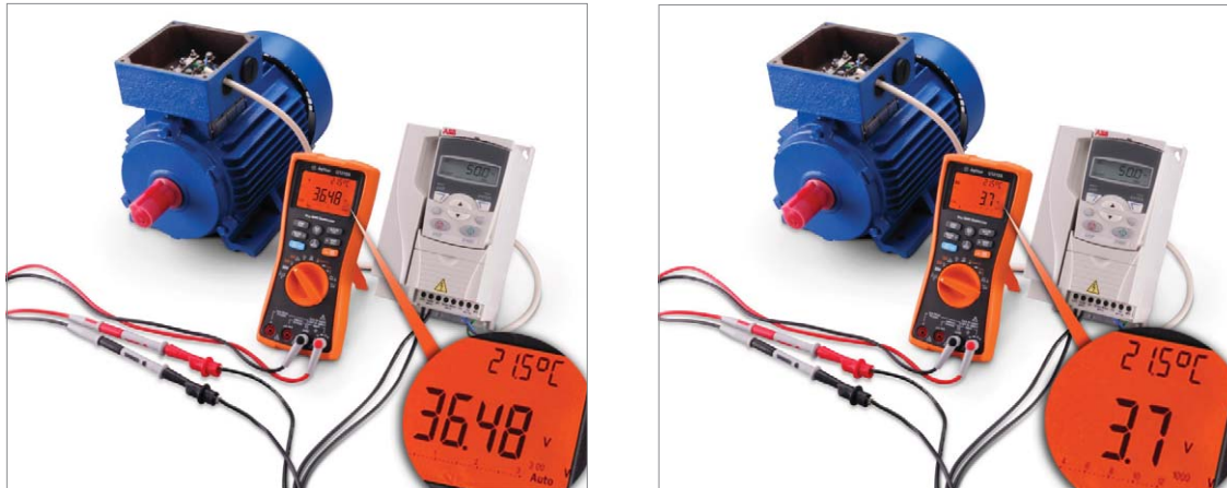
Figure 1: U1272A helps you identify the presence of stray voltage on a disconnected wire running parallel with the wire powering up the VFD to an industrial motor. The image on the right shows the U1272A in low impedance mode.

The U1272A is a dual input impedance digital multimeter. The DMM's high input impedance is preferred in most electrical measurements because it would not load the circuit under test. However, to obtain accurate measurements on circuits that may contain stray voltages, the U1272A's 2 k \Omega low impedance function comes in handy. Stray voltages are usually found in non-energized electrical wiring adjacent to powered wires due to capacitive or inductive coupling between these wires. When a pair of test leads is placed between the open circuit and neutral conductor, the circuit is then complete and forms a voltage divider in conjunction with the input impedance of the multimeter. High input impedance multimeter is sensitive enough to measure voltage coupled into the disconnected conductor, thus giving an inaccurate indication of a live conductor. The low impedance function serves to eliminate false readings by dissipating the stray voltages, thus improves safety and measurement efficiency during voltage.