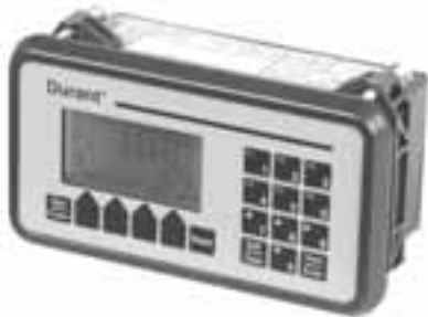
Cat. No. 57550400