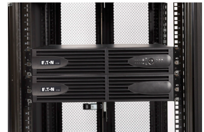
2U rackmount model with 2U EBM—add up to four EBMs for hours of runtime

1. Battery backup times, shown at 0.7 power factor, are approximate and may vary with equipment, configuration, battery age, temperature, etc.