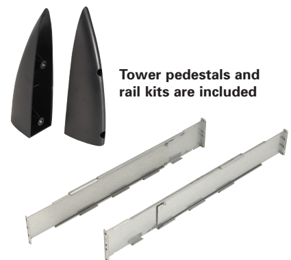
Tower pedestals and rail kits are included