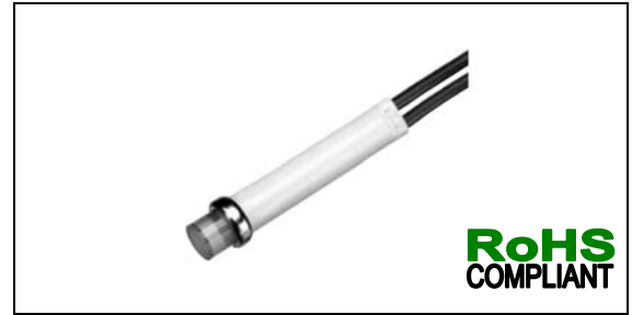
Minimum panel thickness: 0.030"