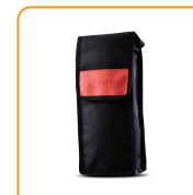
U1175A Carrying case

For full listing of accessories compatible with U1210 Series, visit www.agilent.com/find/clampmeter