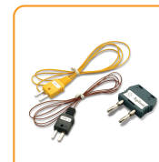
U1180A Thermocouple adapter/lead kit