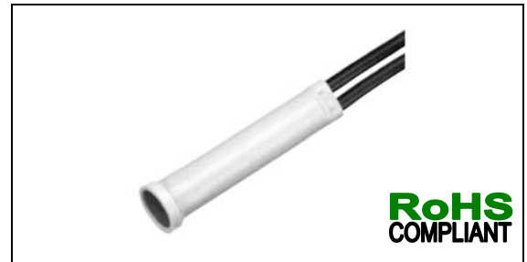
Minimum panel thickness: 0.030"