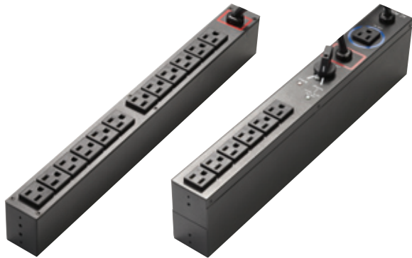
Optional FlexPDU and HotSwap MBP for greater flexibility and uptime