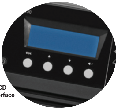
Bright LCD user interface