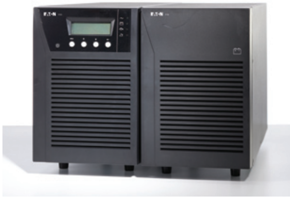
Add up to four EBMs for hours of runtime