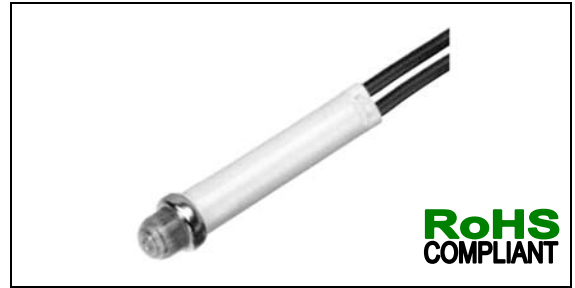
Minimum panel thickness: 0.030"