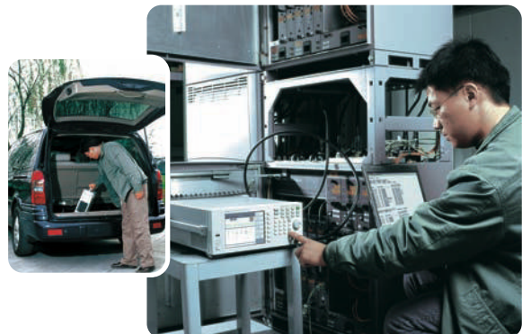
Performing general purpose installation and maintenance, or service and repair, but don't want more test functionality than necessary – Agilent's N9310A RF signal generator is your answer.