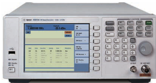
N9310A RF Signal Generator

All the capability and reliability of an Agilent instrument you need — at a price you've always wanted