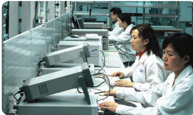
Agilent's new low-cost, compact signal generator provides a money-saving solution in high-volume manufacturing applications.

Now you know the signal generator to choose when you are ramping up your volume manufacturing. Moreover, you can be confident that the price and performance will please your management team, too.