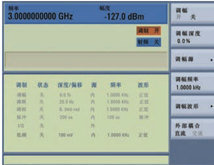
Multi-language display and instruction help ensure easy operation of your signal generator, no matter who's using it.

Optional rack mount kit enables simple stacking with other test equipment in standard test racks. The rackmounted signal generator is full width and a compact, standard 3U height.