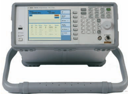
The N9310A can become portable with handle and bumper. It makes it an ideal choice for installation and maintenance.

Being small and lightweight, an N9310A signal generator is as convenient for field troubleshooting use as it is for bench-top use, where space is often at a premium.