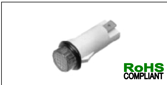
Recommended panel thickness: 0.030" to 0.090"