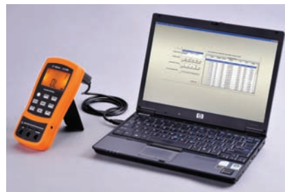
Figure 1: Automate the recording of continuous readings when you hook the U1701A/U1701B to a PC

The handheld capacitance meter comes in a robust overmold and tested to stringent industrial standards. Each capacitance meter is also sealed with a three-year warranty and the assurance that you can test your components with confidence.