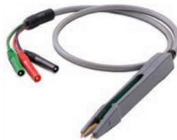
U1782A SMD tweezers