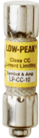
LP-CC-3-1/2 Class CC, Time Delay Fuse

Homepage About Cooper Bussmann Contact Us Privacy Legal Cooper Bussmann® Brand Site Map