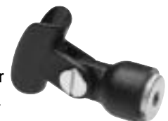
Tripod Mount Microphone Holder Model No. 00184