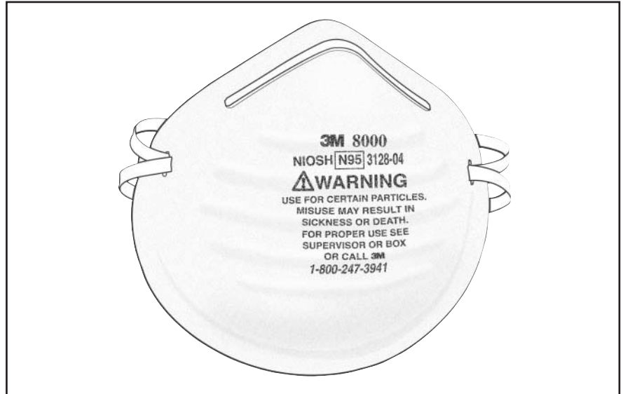
3M™ Particle Respirator 8000, N95