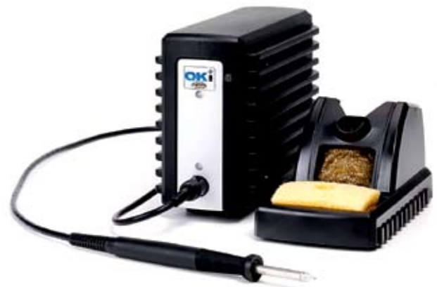
MFR-1160 (MFR-1100 Single Output Soldering & Rework System with MFR-H6-SSC hand-piece)