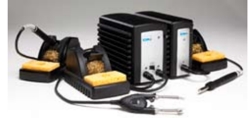
MFR-2241 with MFR-1120