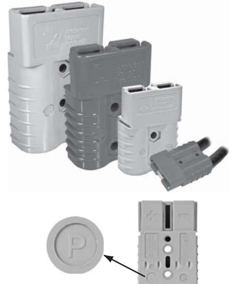
Chemical Resistant housings are marked with a "P" on the backside of the housing