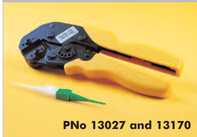
PNo 13027 and 13170