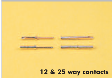
12 & 25 way contacts