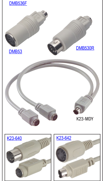
2008 Master Catalog 1.0

Shop at L-com.com or call 1-800-343-1455 E-mail: sales@L-com.com Fax: 978-689-9484