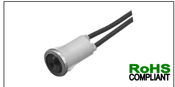
Recommended panel thickness: 0.030" to 0.090"