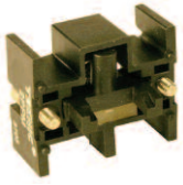
Push Push mechanism for converting spring return actuator into maintained Cat. No. 2PPM