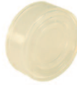
Transparent Silicone Rubber Boot for Flush Actuators Color: Clear Cat. No. 2BT7 (for non-illuminated) 2ALBT7 (for illuminated)