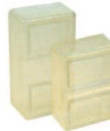
Rubber Boot for Twin Actuators Color: Clear Cat. No. 2ATBT7 (Non-Illuminated) 2ATLBT7 (illuminated)