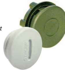
Blanking plug for 22.5 mm holes Color: Black Cat. No. 2BP2 Blanking plug for M20 (20mm) or NPT 1/2" holes Color: Gray Cat. No. M20 Cat. No. NPT1/2