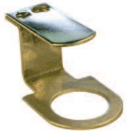
Padlock For mushroom actuator: Cat. No. 2PAM For projecting actuator: Cat. No. 2PAP