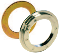
Adapter for installing a Ø22.5 device in Ø 30.5 cutout Cat. No. 2ADP (with washer) ADW (washer only)