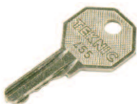
Replacement Keys For all 22mm operators with keys Cat. No. 2KY455