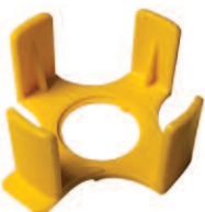
E-Stop Shroud Plastic protector: Cat. No. 2ESS1 Plastic protector (UL): Cat. No. 2ESS1-UL