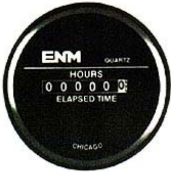
T50 Quartz AC Hour Meter I. T50 Quartz AC Hour Meter

Item # T50A4 T50 Quartz AC Hour Meter I.