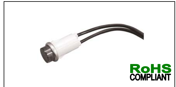
Recommended panel thickness: 0.030" to 0.090"