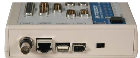
USB A/B & 1394 Fire wire Interface